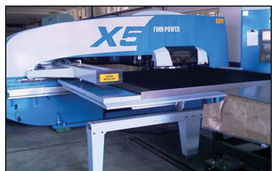
Just commissioned turret press in operation at Khanvel factory