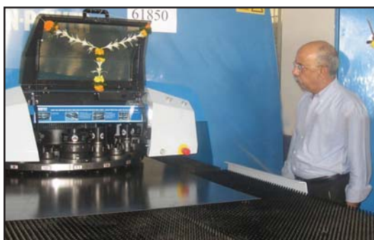
Silvassa Plant Inauguration

We are adding 70000 sq.ft. of manufacturing facility with a new machine shop and an automatic powder coating, material handling system. This will also house a computerised testing facility.